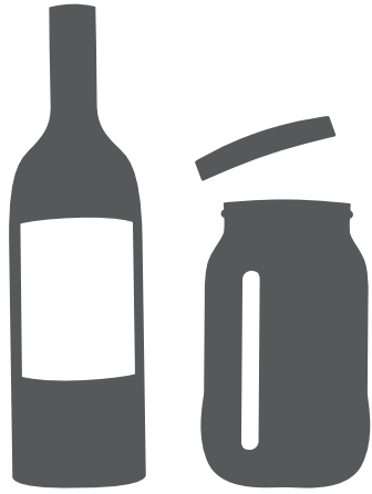
Glass bottles and jars (lids removed)