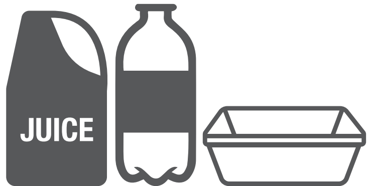
Plastic bottles and containers (lids removed)

Items must be rinsed, empty and loose in the bin.