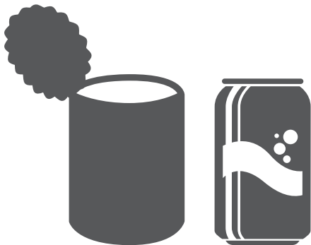
Aluminium and steel