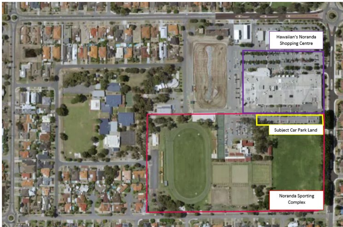
Figure 1 – Location Plan