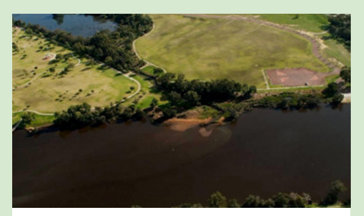
Aerial view of the sediment build up in the Swan River coming from the Bayswater Brook