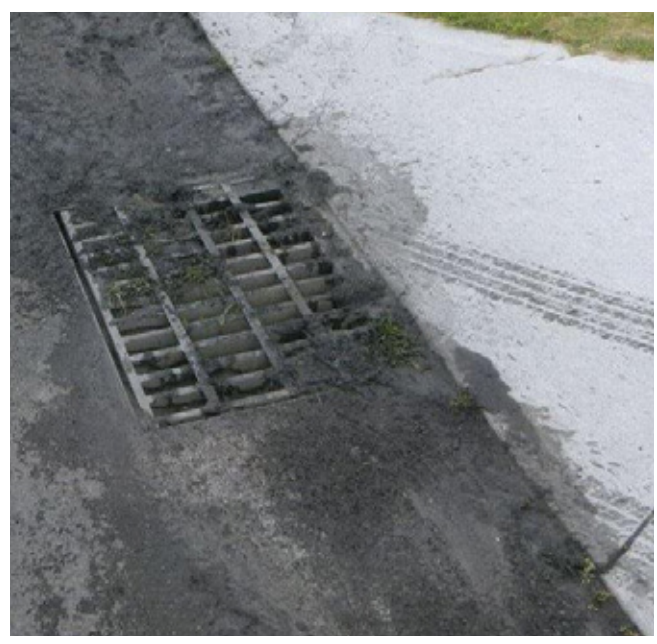
Sediment can end up in storm drains.

The City estimates that $15,000 is budgeted for the maintenance of drainage infrastructure where builders' sediment has run-off from building, subdivision and constructions sites and been captured, requiring removal. This cost represents approximately 10% of the City's annual drainage maintenance budget.