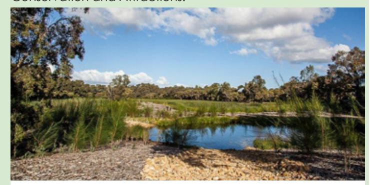
The Eric Singleton Bird Sanctuary after restoration works.

One of the largest projects of its kind, this $3 million civil re-construction rehabilitation project was completed in 2015 in partnership with the Department of Biodiversity, Conservation and Attractions.