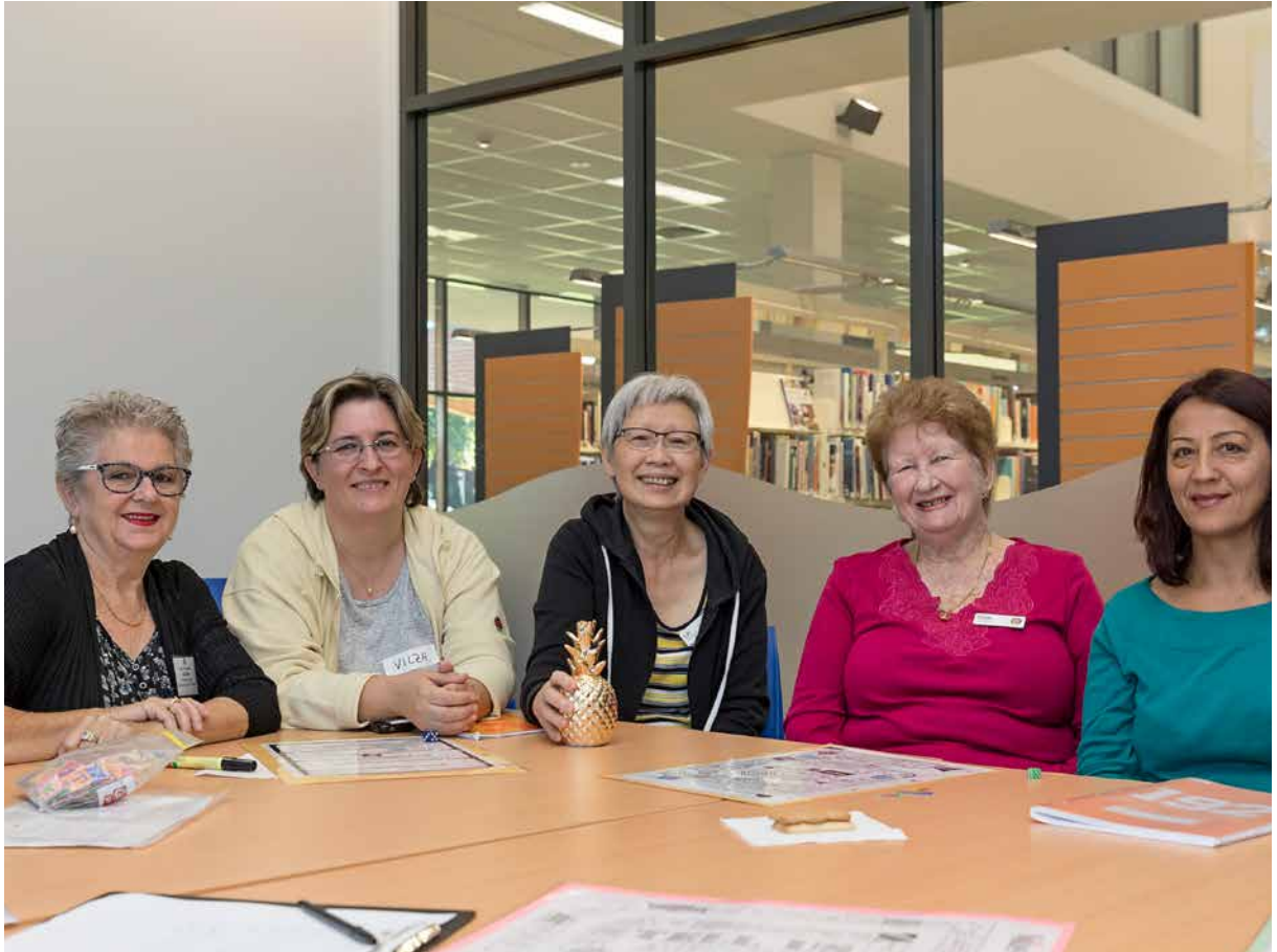
English conversation group volunteers, Maylands Library.