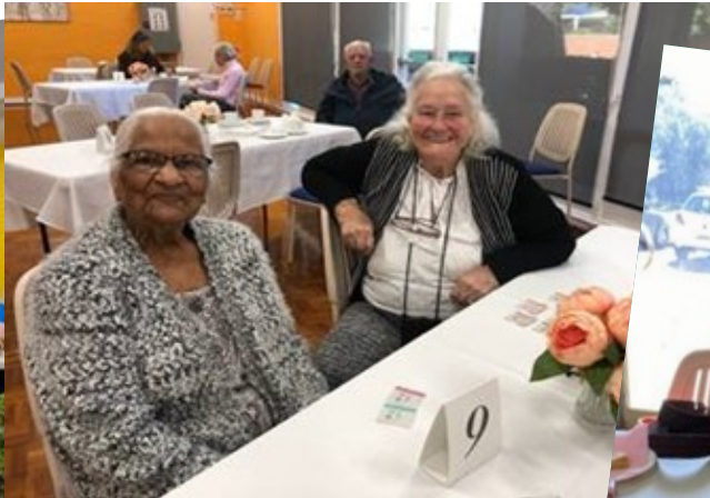
Biggest morning tea