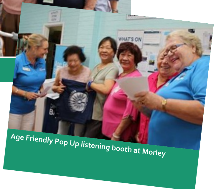
Age Friendly Pop Up listening booth at Morley