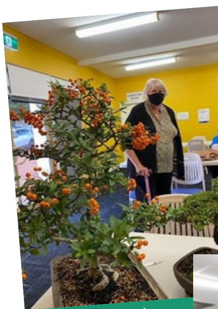
Bonsai demonstration at Link and Learn

The last few months have seen a number of special occasions for members and volunteers – can you spot yourself in any of these photos?