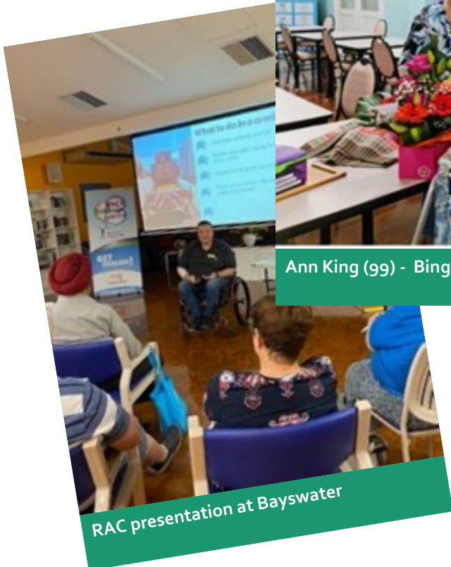
RAC presentation at Bayswater