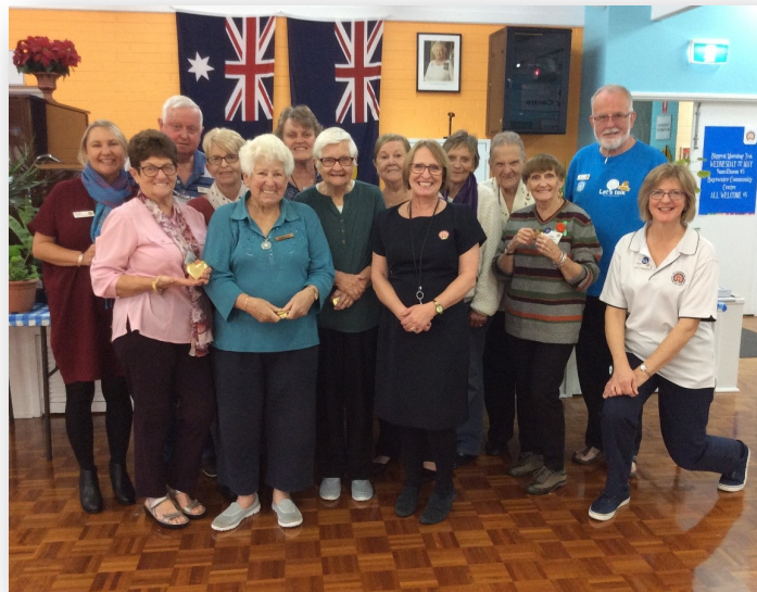
Biggest morning tea volunteers and staff.

There would be few amongst us who have not been touched in one way or another by cancer, and our thanks go to everyone who supported the event. An amazing $1,865 was raised on the day and has been sent to the Cancer Council.