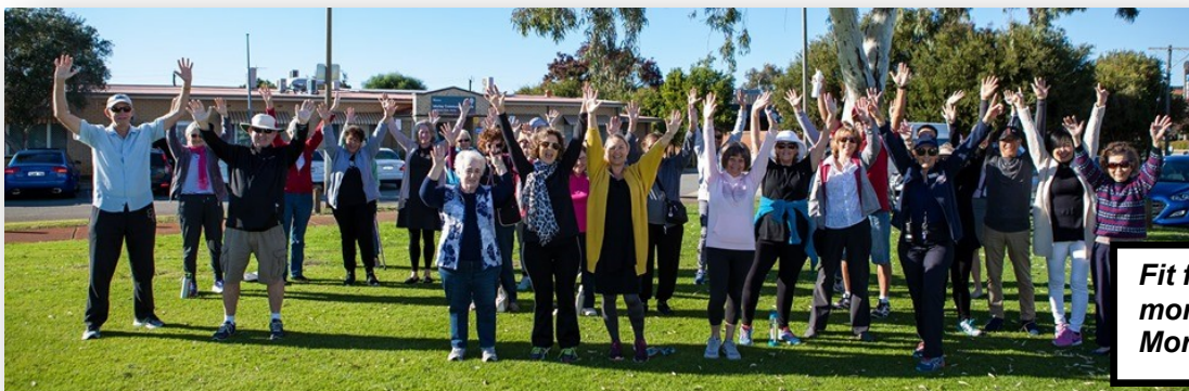
Fit for Life celebratory morning tea and walk at Morley Community Centre