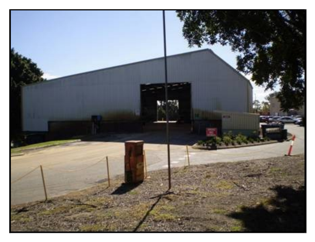
Figure 3- Solid waste transfer shed exit