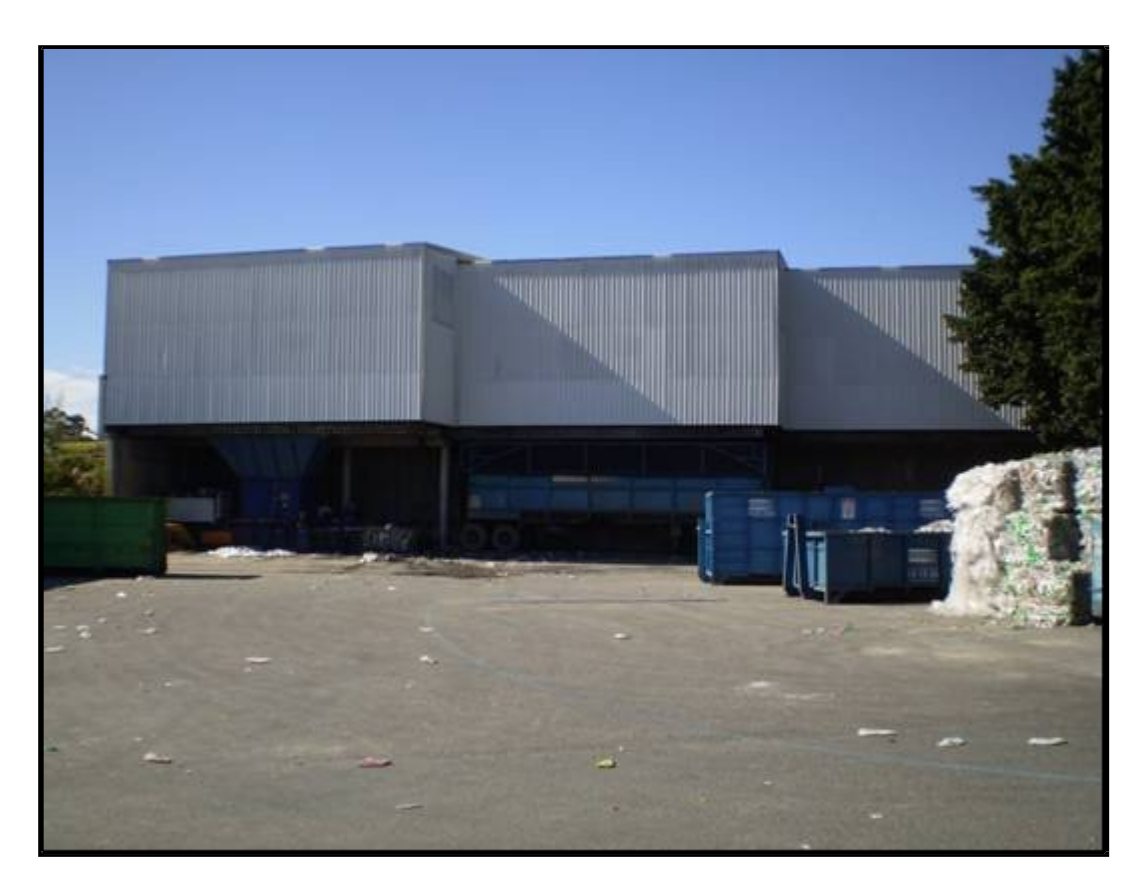
Figure 8 – Solid waste shed west side showing collection bins