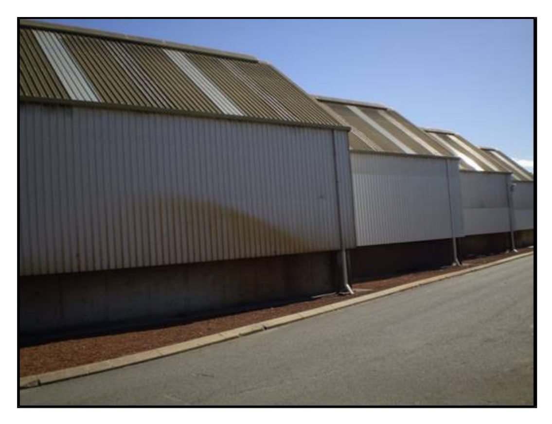
Figure 4- MRF eastern side