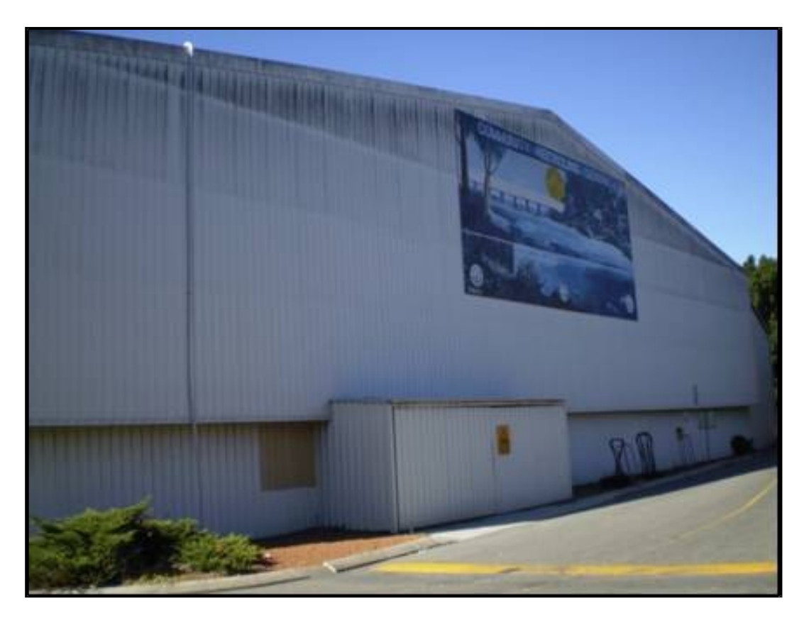
Figure 7 - MRF Tonkin Highway side