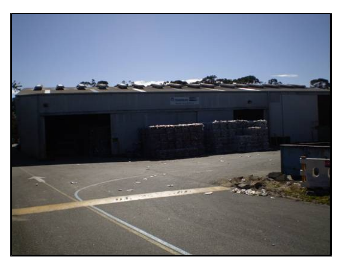
Figure 9 - MRF main entry south side