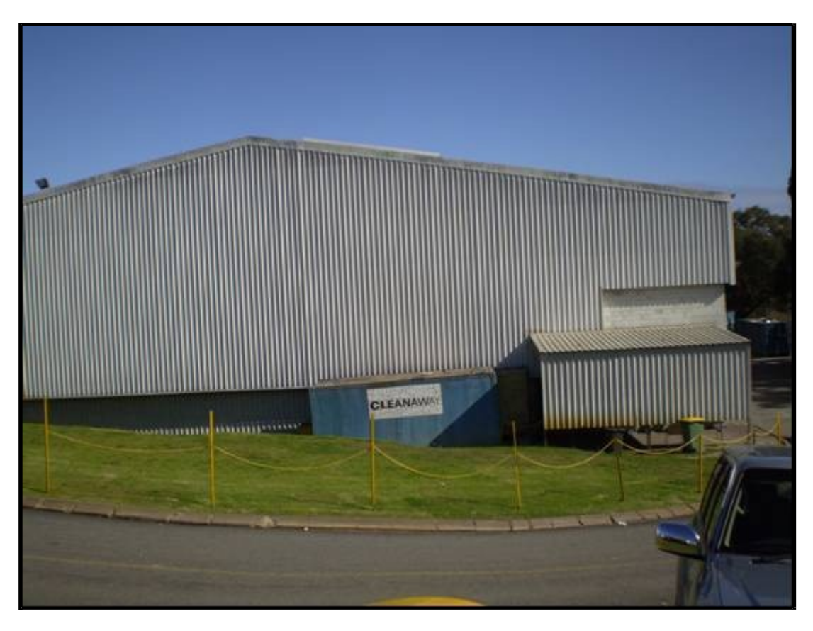
Figure 6 - MRF eastern side