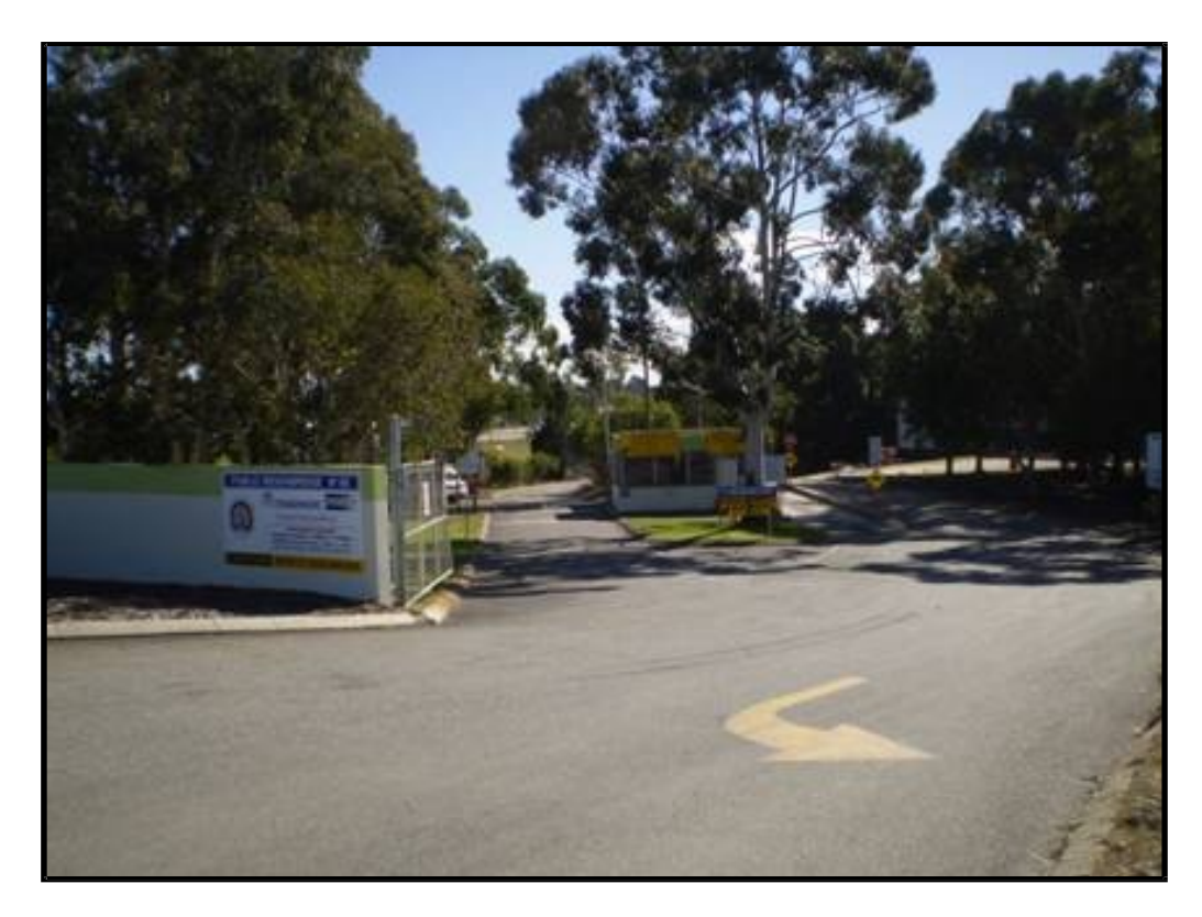
Figure 1 - Front view showing gatehouse and weighbridge