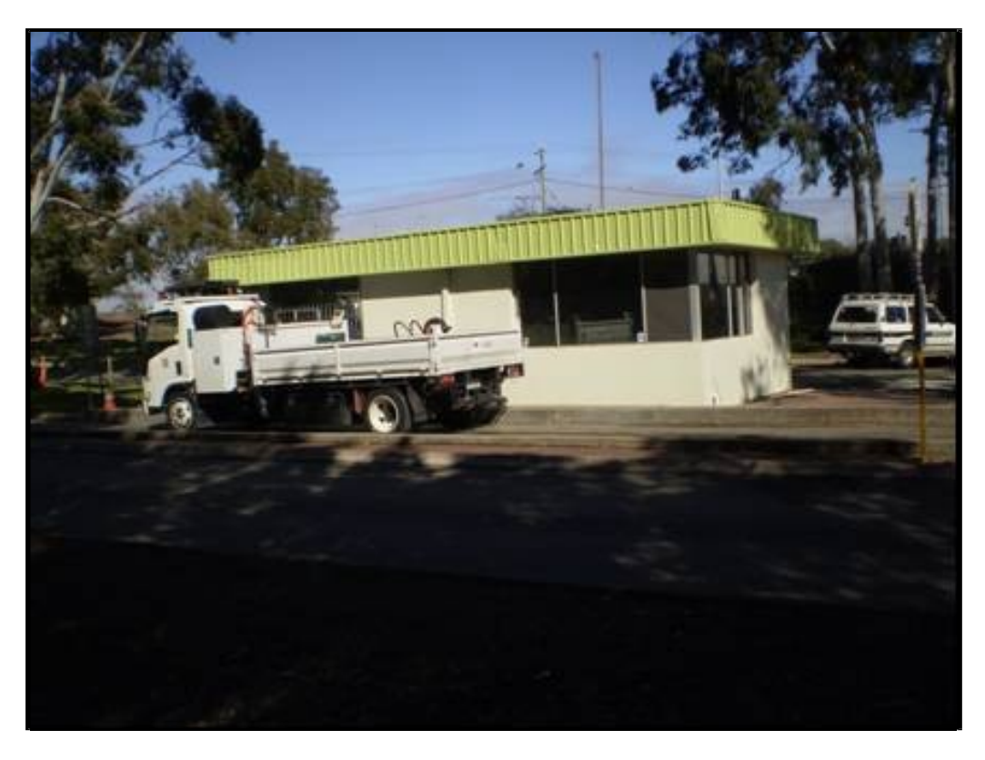
Figure 2 - Gatehouse exit eastern side