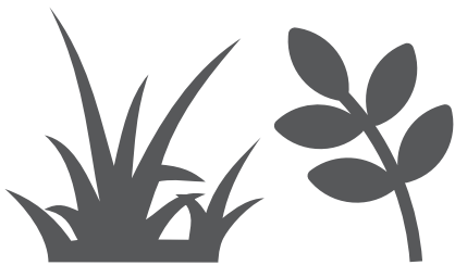
Lawn clippings and garden vegetation