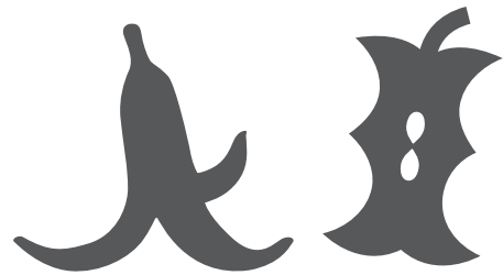
Fruit and veggie scraps