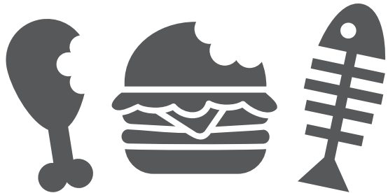
Food scraps (including meat and bones)