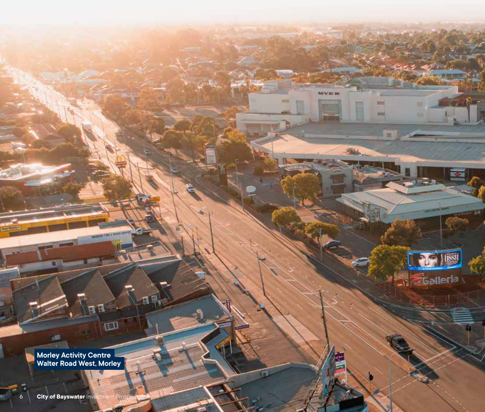
Morley Activity Centre Walter Road West, Morley

The City's current population of 71,796 is forecast to grow to 100,000 by 2050. The City has adapted its planning framework to accommodate future growth by supporting investment in the City.