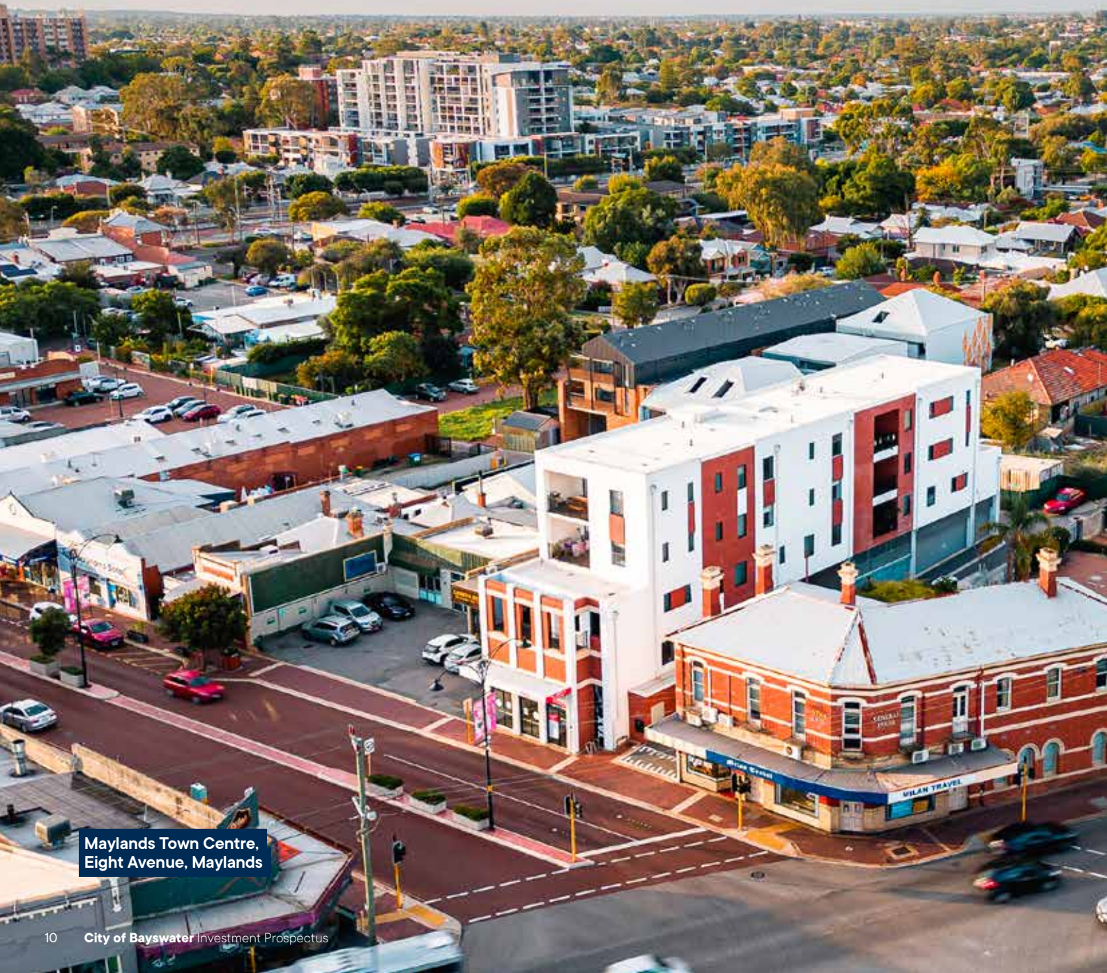
Maylands Town Centre, Eighth Avenue, Maylands

The planning framework in Maylands allows for buildings of up to eight storeys on both sides of the Maylands Train Station. New apartment buildings have recently been constructed on the northern side of the train line.