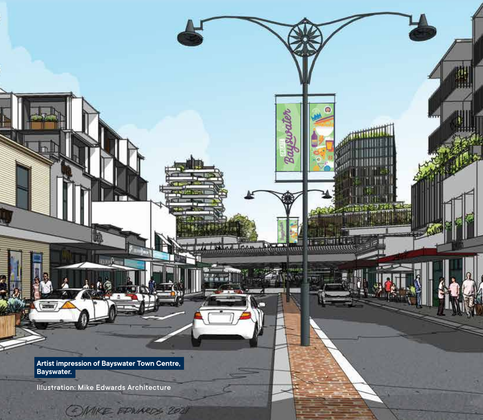
Artist impression of Bayswater Town Centre, Bayswater.

The planning framework introduced by DevelopmentWA will encourage more people to live within walking distance of the train station. It aims to conserve the character of the area while allowing for heights of up to 15 storeys.