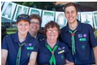
Bayswater Lacrosse Club

Some photos from the Community Open Days are pictured below: