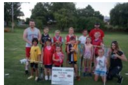
Hampton Park Scouts