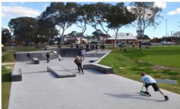
Neighbourhood Park: Bassendean Skate Park Guildford Rd, Bassendean WA