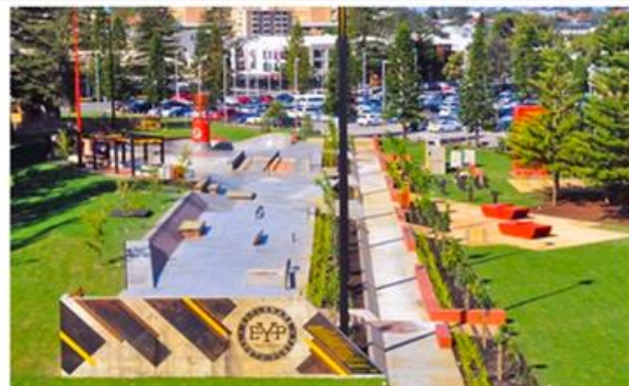
Skate Park Hub: Fremantle Skate Park 54 Marine Terrace, Fremantle WA

Based on past condition and feasibility reports, the current skate and BMX facilities within the City are ageing and require significant ongoing maintenance. Once at the end of their serviceable lifecycle, the current facilities may be demolished and replaced in their current location or alternative options explored.