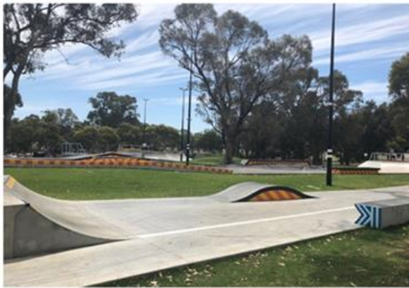
Skate Node: Edge Skate Park Calista Oval, Gilmore Avenue, Kwinana WA

Examples for each across the metropolitan areas are provided below: