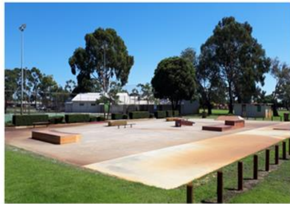
Skate Spot: Crimea Skate Park Calista Oval, Gilmore Avenue, Kwinana WA