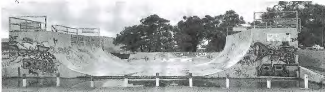
Check-out the overlay of Broun Park with overflow parking.