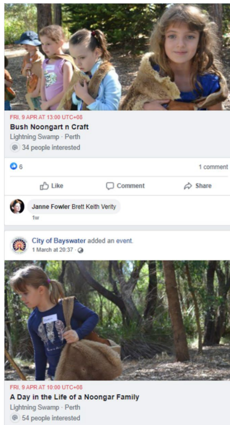
Image 2 Parks and Wildlife Service WA Nearer to Nature school holiday activities hosted by City of Bayswater at Lightning Swamp, Friday 9 April 2021.