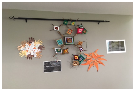
Image 5 Compilation of Harmony Day and April Djiran season workshops, Maylands Library, 20 March 2021 and 17 April 2021.