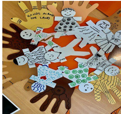
Image 2 Noongar language and Cultural Session, Harmony Day art activity, theme (inclusiveness, respect and a sense of belonging), Maylands Library, 20 March 2021.