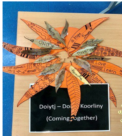
Image 4 Doiytyj – Doiytyj Koorliny (Coming together) Harmony Day themed workshop, group artwork, Maylands Library, 20 March 2021.