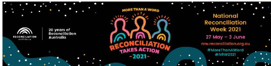
Image 1 Reconciliation Australia: National Reconciliation Week 2021 theme - 'More than a word. Reconciliation takes action'