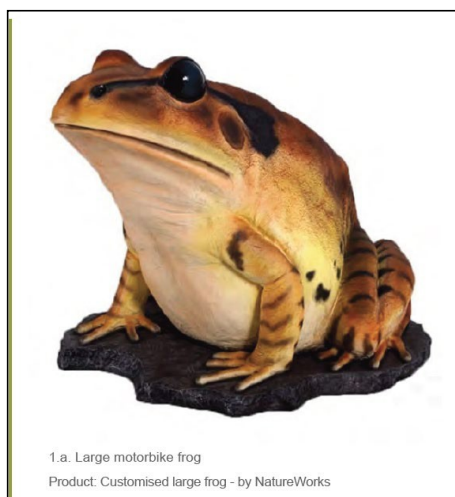
Image 2 Example of custom made, giant size Motorbike Frog.