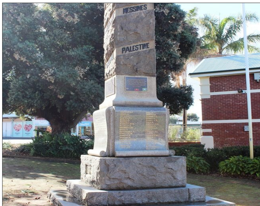
Image 1 Maylands War Memorial Commemorative plaque honouring Aboriginal and Torres Strait Islander World War One veterans, unveiled Monday 6 July 2015