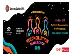
Image 3 City of Bayswater invitation to the City's RAC to attend the Reconciliation WA NRW breakfast, Friday 28 May 2021.