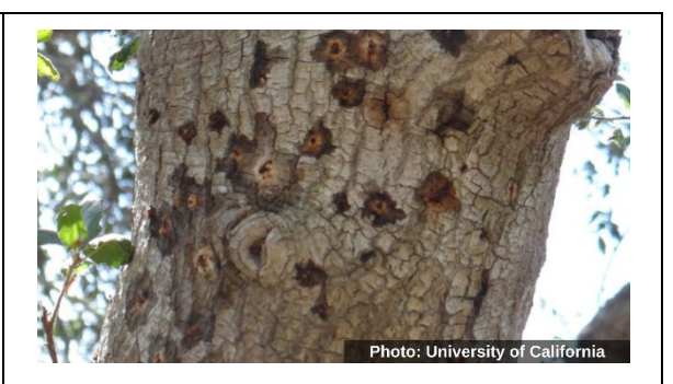
Discoloration/staining of wood The Fusarium fungus cultivated by the beetle can cause dark discoloration.

Beetle entry hole The entrance holes of PSHB are approximately the size of a ballpoint pen tip.