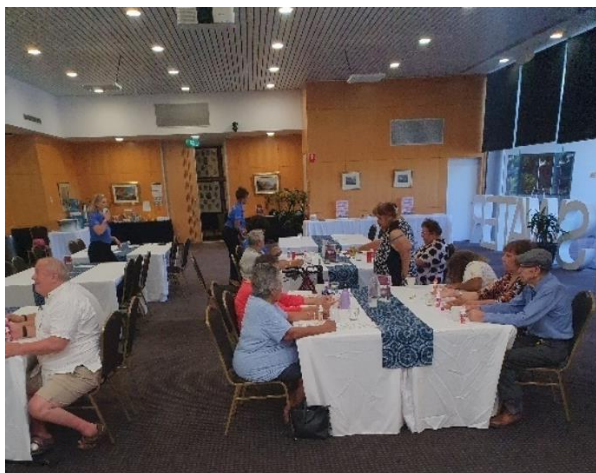
Image 1: Easter Everlasting Elders Bingo at Bayswater Civic Centre