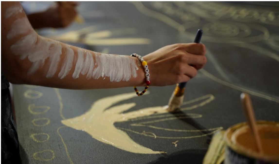
Image 1: Students created a beautiful artwork at Hampton Senior High School NAIDOC Week Community Event.