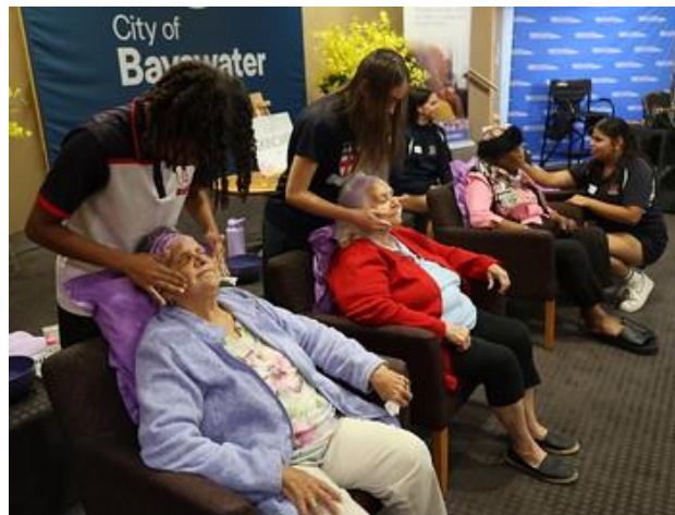
Image 2: Everlasting Elders Pamper Day at City of Bayswater Civic Centre