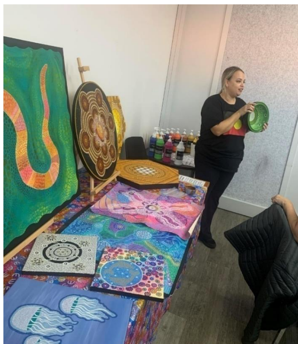
Image 1: NAIDOC Week art workshop at Morley Library with Aboriginal Artist.