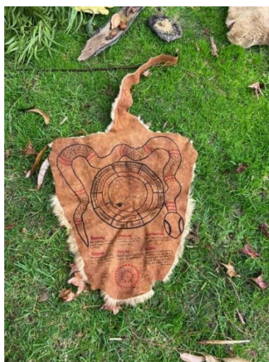
Image 4: Kangaroo skin at Koort Kuoba (Good Heart) Workshop and Community Planting Day at Eric Singleton Bird Sanctuary.