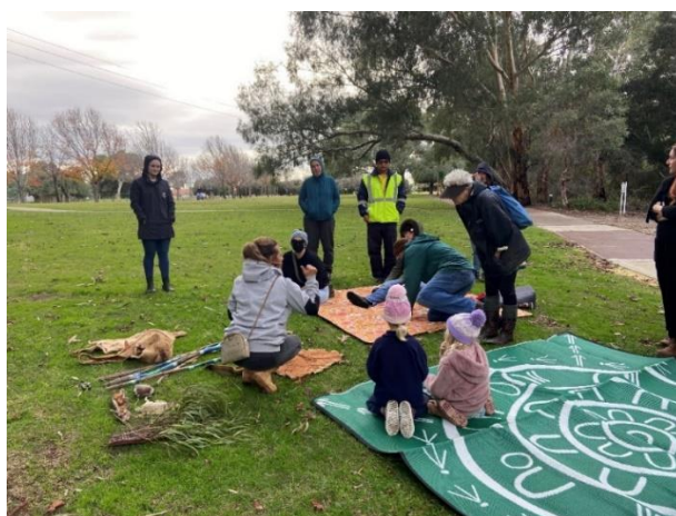
Image 3: Koort Kuoba (Good Heart) workshop and community planting day at Eric Singleton Bird Sanctuary.