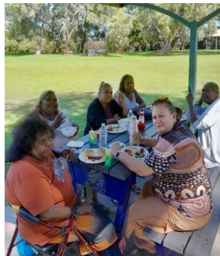
Images 1 & 2: Participants at Moorditj Wirin Circle enjoying activities.