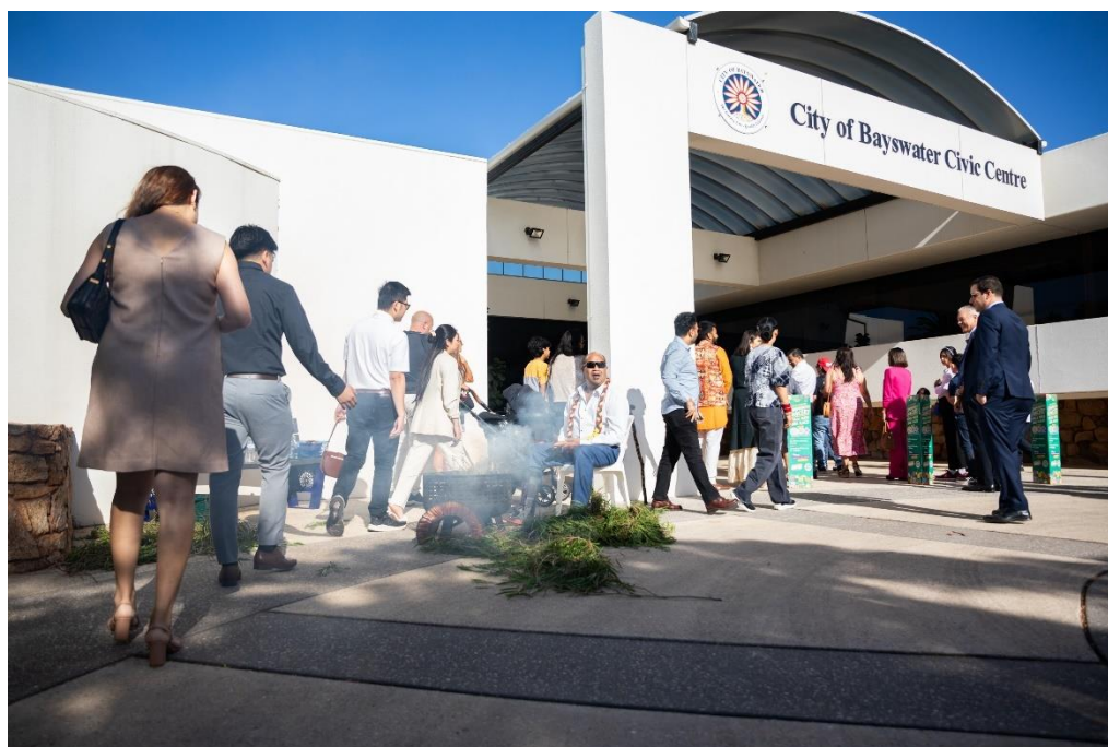
Image 1: Smoking ceremony for National Reconciliation Week event 2024.