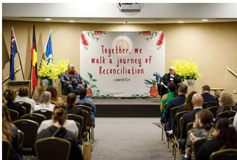
Image 1: City of Bayswater National Reconciliation Week 2024 event.