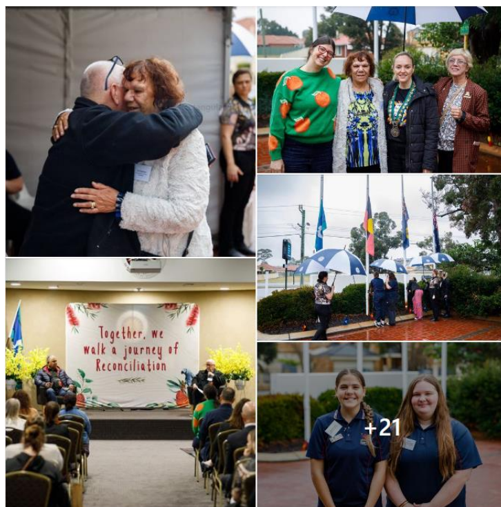
Image 3: Facebook post about City of Bayswater National Reconciliation Week 2024 event.